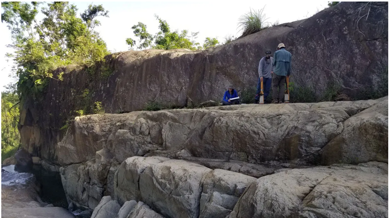
Students from Florida Atlantic University conduct a ground-penetrating radar survey in June 2018 along the Rio Blanco in El Yunque National Forest, Puerto Rico.

Earth's near-surface environment, which extends from the ground surface to a depth of several kilometers, is but a small fraction of the planet. Yet its importance cannot be overstated for all of us who call it home. This region hosts most of the rock, mineral, soil, groundwater, ice, and surface water resources we use daily and