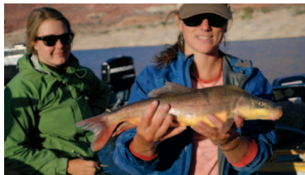
Razorback suckers, listed as endangered in 1991, are finding their way back to the Grand Canyon.