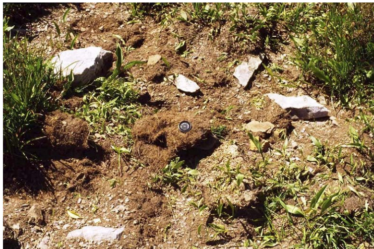
Fig. 5. Area excavated by grizzly bear in search of tubers and roots. Note the 49 mm lens cap for scale.

Although the study of the geomorphic impacts of native animal species on the Australian landscape is an area of increasing interest (e.g., Bennett, 1999; Eldridge and Rath, 2002), the impacts of native species on the Australian landscape has been overshadowed by research