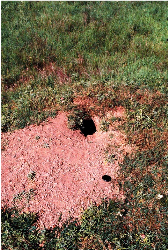
Fig. 4. Typical entrance to a prairie-dog burrow in Devils Tower National Monument, northeastern Wyoming, USA. Note the associated sediment mound with 49-mm lens cap for scale.

until European Contact (Lomolino and Smith, 2001). Over 40 million hectares of the prairie region were occupied by black-tailed prairie dogs in the early 1900s (Senseman et al., 1994), an area representing more than 20% of the natural short- and mixed-grass prairies (Whicker and Detling, 1988). Since the early 1900s, the range of the prairie-dog has been reduced to less than 600,000 ha by eradication efforts associated with American agriculture (Lomolino et al., 2003). In Texas alone, historic populations of black-tailed prairie dogs were estimated in the early 20th Century at 800 million individuals occupying over 230,000 km 2 ; eradication efforts and land-use changes have reduced the Texas population by greater than 99% (Weltzin et al., 1997).