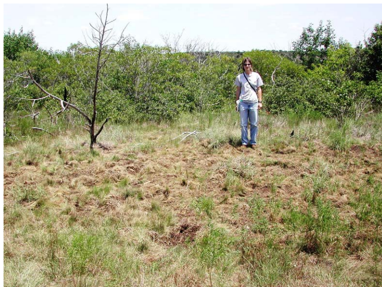
Fig. 6. Area trampled and rooted by feral hogs, central Texas, USA.

Feral burros and horses are pests with significant geomorphic impacts in the western United States and in Australia (Symanski, 1994; Pimentel et al., 2000; Dukes and Mooney, 2004; Edwards et al., 2004), although data on specific numbers of each are controversial (Symanski, 1994). Feral burros, Equus asinus , and feral horses ( Equus caballus ) are common animals in many areas of the American southwest (Hanley and Brady, 1977; Pimentel et al., 2000) as well as in Australian rangelands (Edwards et al., 2004). They graze on, and drastically reduce, native vegetation so that native perennials are replaced by annuals. The grazing also reduces the overall surface vegetation cover and exposes a greater area to raindrop impact, surface runoff, and sediment dispersal (Hanley and Brady, 1977). They also presumably contribute to widespread erosion (Edwards et al., 2004) via the "trampling" process as illustrated schematically by Hall and Lamont (2003) (Fig. 1). These direct erosional impacts, as well as the secondary erosional impacts attributable to vegetation cover change and overall reduction of vegetation, have been qualitatively observed but are completely unquantified in the geomorphic literature.