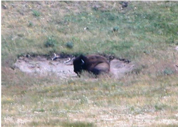
Fig. 2. Bison in so-called “buffalo wallow” in shortgrass prairie, Waterton Lakes National Park, southwestern Alberta, Canada.

loading of slopes. The latter activity has not been described in detail for bison, and is not examined further here.