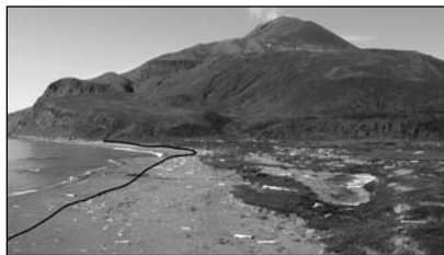
Figure 2. Post-tsunami (2007) view of Ainu Bay, Matua (Fig. 1). Black line marks seaward extent of vegetation in 2006. Prominent driftwood logs in the foreground are ~4 m long.

Because 10 months (September–June) passed between 2006 and 2007 field observations, we must address the question of whether the 2006 tsunami was the primary agent of observed changes. Other possible agents include the 2007 Kuril tsunami, storms, and seasonal wave regime. Seasonal effects are controlled for by our repeat survey in 2008. Moreover, there was a lack of large regional storms between field seasons (see the GSA Data Repository text, and Figs. DR2 and DR3 1 ). We reason that the January 2007 tsunami caused little change because it was much smaller and occurred when the shoreline was frozen (MacInnes et al., 2009).