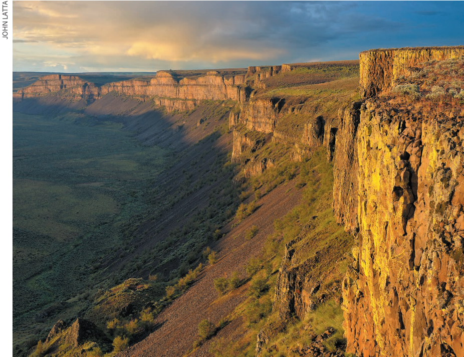
Figure 2 | Moses Coulee. Upstream view along the east wall of Moses Coulee, a canyon in the Channeled Scablands of Washington state.

forces required to erode blocks of rock, and the notion that the floods were just large enough to erode their beds. It will also be challenging to confirm that similarly modest floods formed other Channeled Scabland canyons, because not all canyons contain features that record the progress of canyon incision in the same way as the well-preserved terraces in Moses Coulee. However, observations of erosion by smaller, modern floods 9 support the principles behind the authors' approach.