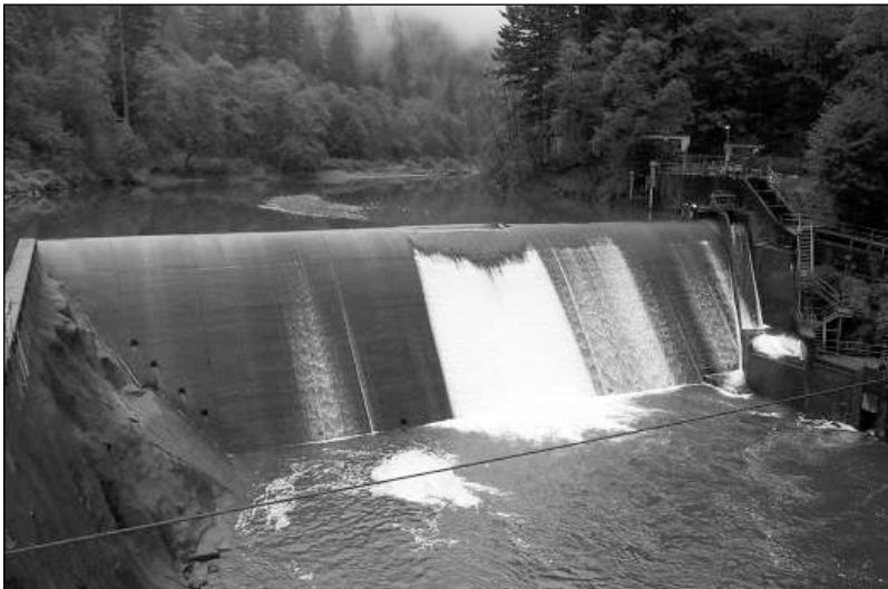
Approximately 100,000 dump trucks worth of sediment will be released from a “blow and go” dam removal on the Sandy River in Oregon.

“Men may dam it and say that they have made a lake, but it will still be a river. It will keep its nature and bide its time, like a caged animal alert for the slightest opening...”