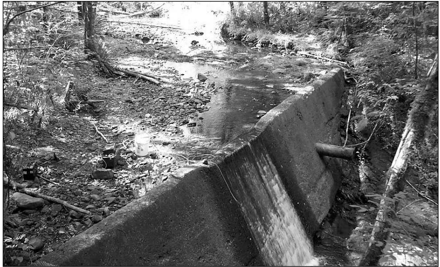
The reservoir behind Dinner Creek Dam was completely full of sediment in 2002, before the dam was torn down.

There are many reasons owners might chose to remove their dam. "Like anything you build, dams have a lifespan. Beyond that, they can pose risks to people and property downriver," says Grant. Often it is simply a cost benefit analysis; once the costs of operating and maintaining the dam in a safe condition exceed the benefits gained from hydroelectric power, irrigation, or flood control, then removal becomes a feasible option.