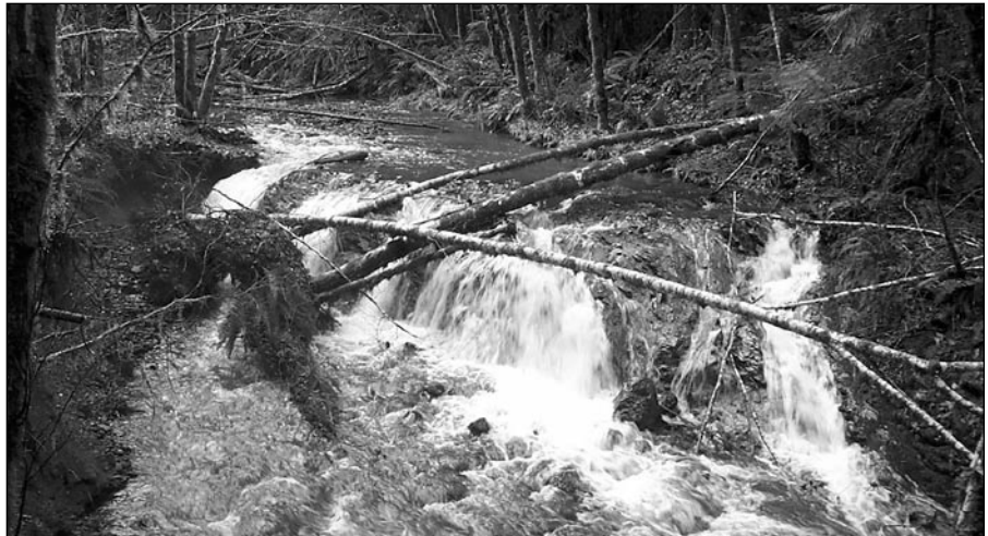
After Dinner Creek Dam was removed, the creek eroded through the sediment toward the former stream bed.