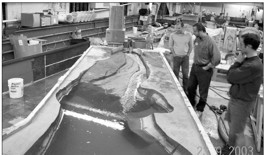
A miniature version of the Glines Canyon Dam on the Elwha River in Olympic National Park, Washington, was constructed to model the release of sediment after the dam is removed in 2008.

Erosion continues until the stored sediment is gone or vegetation establishes on the remnant deposit. Typically, the sediment stored behind small dams will be transported downstream with only modest effects on channel morphology.